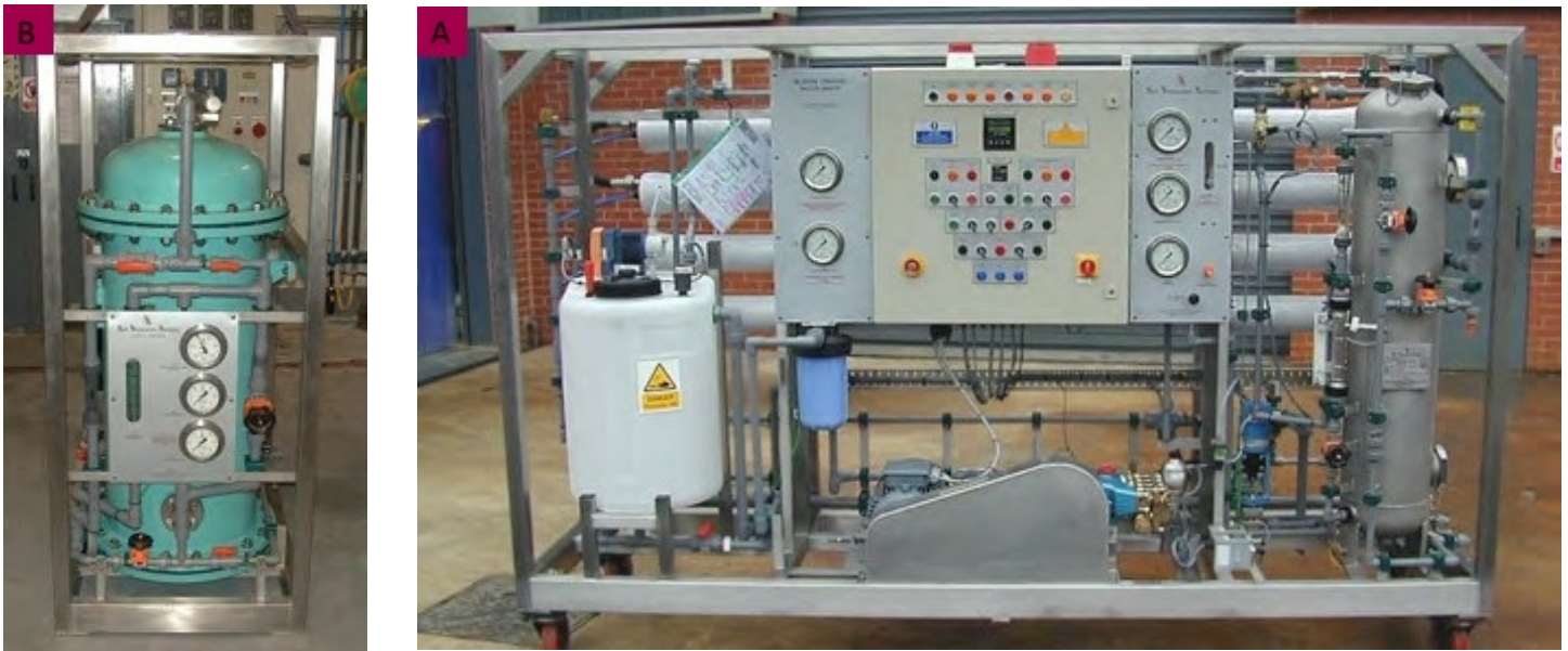
Figure 1: Images of Rothera plant (A. Sand filter and B. RO unit), courtesy of Salt Separation Services, UK.

The normalized permeate flow remained very stable during the data collection timeframe, indicating no effect of long term low temperature operation.